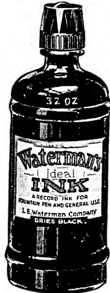
Quart with Pour-Out. Packed 6 to Carton. Shipping Wt. 26 lbs.